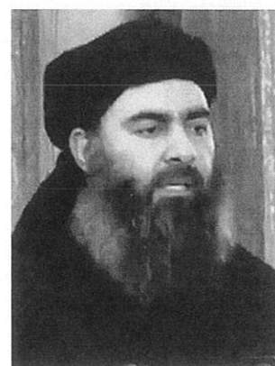
Abu Bakr al-Baghdadi

State of Iraq leader Abu Bakr al-Baghdadi dispatched operatives to Syria to set up JN. Among them was Abu Muhammad al-Jawlani, the leader of what would become JN, which officially announced itself in late January 2012. By November 2012, Jawlani had built JN into one of the opposition's best fighting forces, and locals viewed its members as fair arbiters when dealing with corruption and social services.