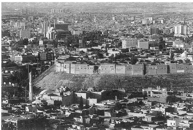
Mosul — home of the Islamic State of Iraq